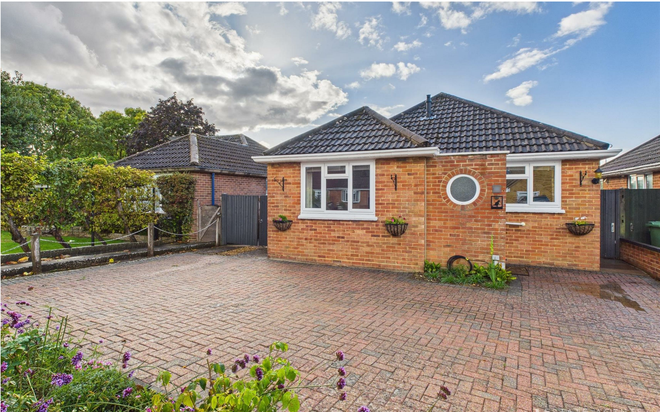
Brackley Way, Berg Estate, Basingstoke, RG22 6LN